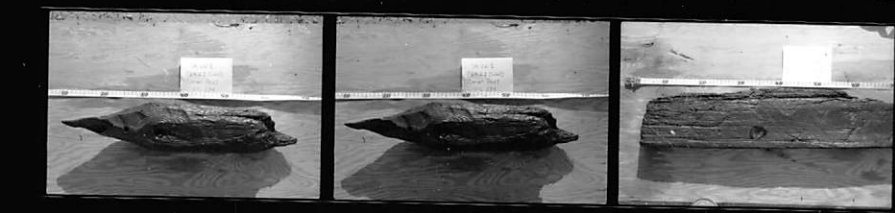
5062 KODAK SAFETY FILM 5062 KODAK SAFETY FILM 5062 KODAK SAFETY FILM 5062