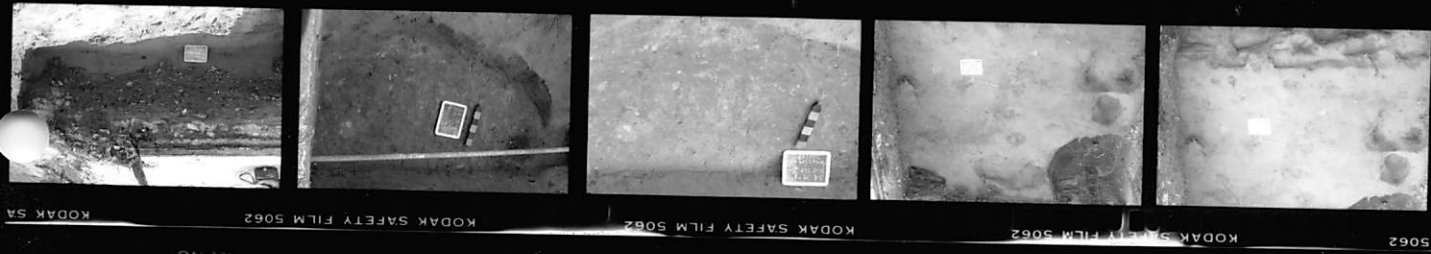
5062 KODAK SAFETY FILM 5062 KODAK SAFETY FILM 5062 KODAK SAFETY FILM 5062 KODAK SAFETY FILM 5062 KODAK SAFETY FILM 5062