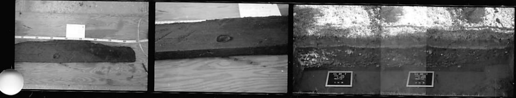
5062 KODAK SAFETY FILM 5062 KODAK SAFETY FILM 5062 KODAK SAFETY FILM 5062