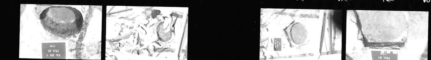
5062 KODAK SAFETY FILM 5062 KODAK SAFETY FILM 5062 KODAK SAFETY FILM 5062 KODAK SAFETY FILM 5062