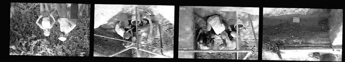
5062 KODAK SAFETY FILM 5062 KODAK SAFETY FILM 5062 KODAK SAFETY FILM 5062 KODAK SAFETY FILM 5062