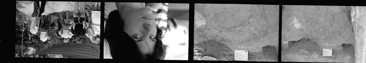
5062 KODAK SAFETY FILM 5062 KODAK SAFETY FILM 5062 KODAK SAFETY FILM 5062 KODAK SAFETY FILM 5062